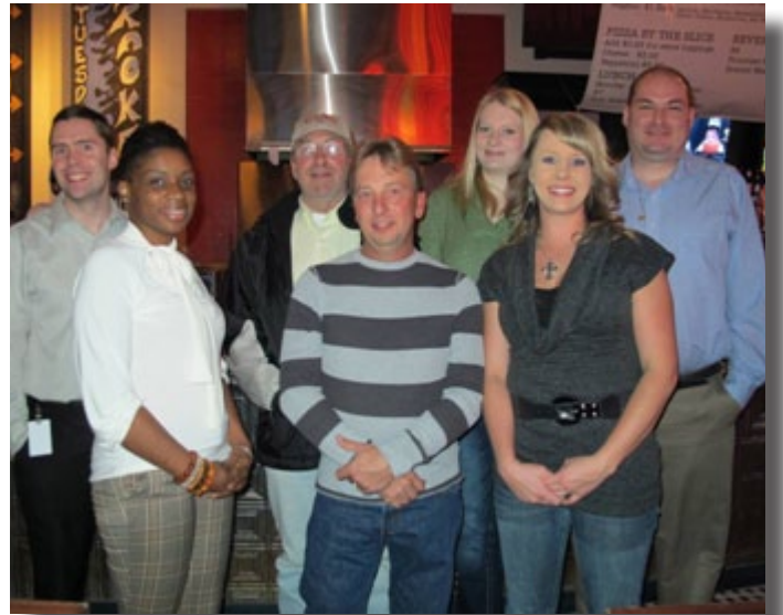
GRADS AND STUDENTS GET TOGETHER AT EVENT IN KANSAS CITY

Hosts may choose a venue and date for the event, and decide whether the event will be casual mingling or more organized with a presentation. Alumni Relations also helps support a host in preparing for an event by providing some giveaway items to share with participants and by promoting the event.